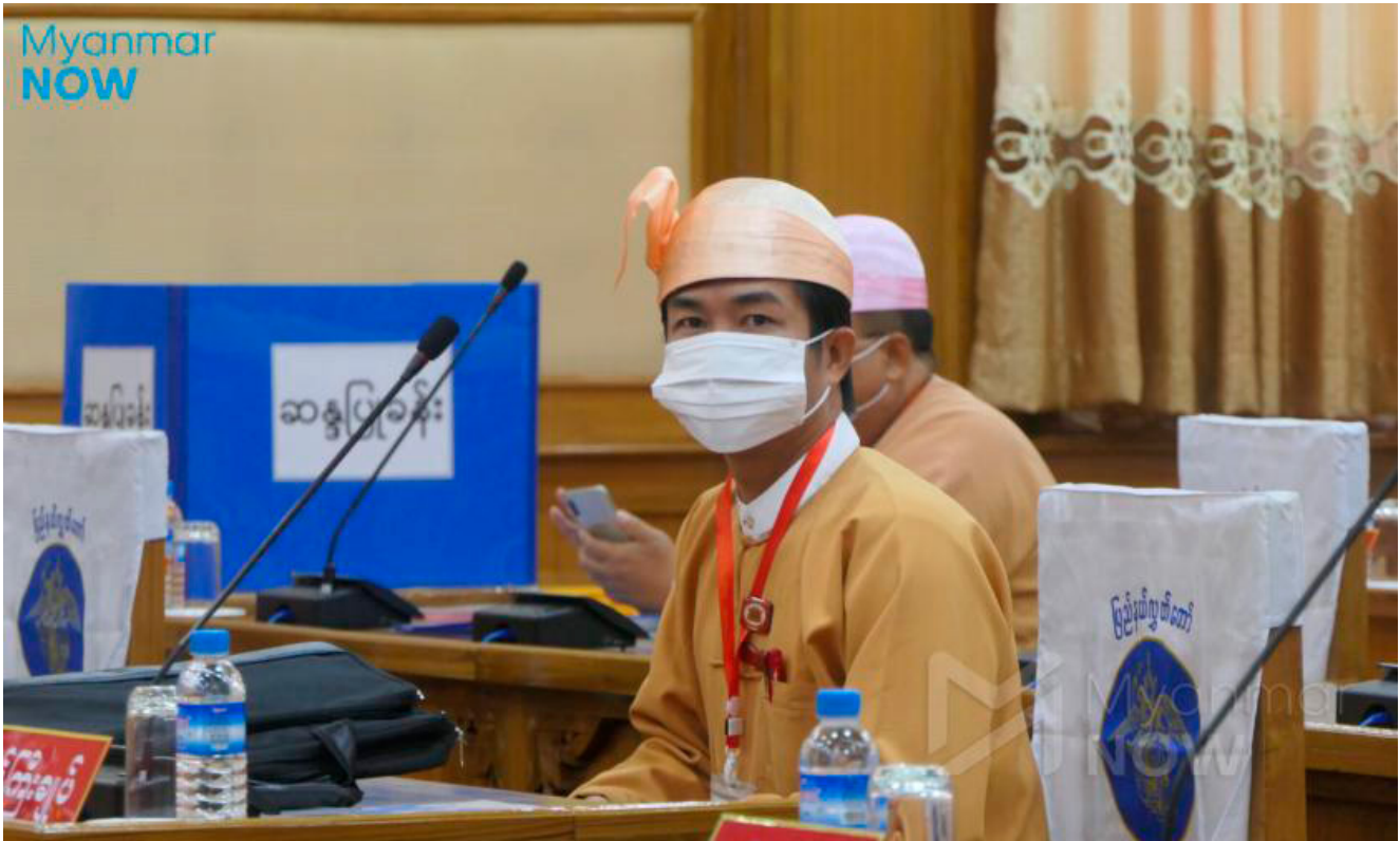
Kayah State Chief Minister attends the Hluttaw meeting on September 1.